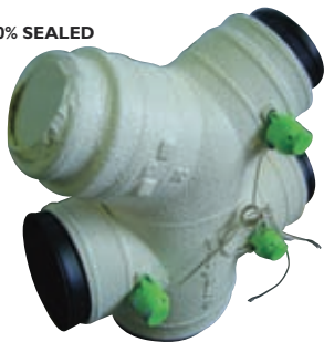
Fitting set up for 3 outlets (All motorized - note one uncut outlet)