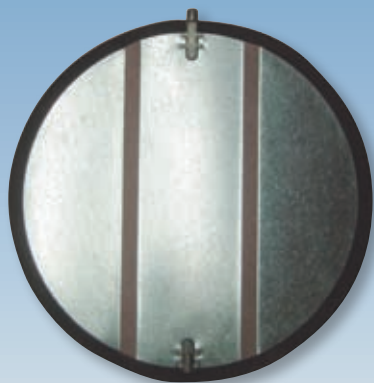
Folded Metal Damper Blades