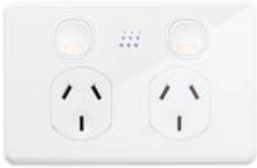
WHITE Part No: PMPP