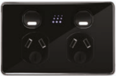
BLACK Part No: PMPPBK